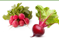
Radishes and Beets