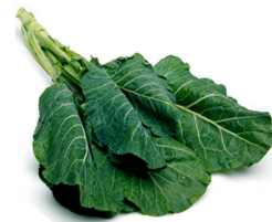
Greens Collard, Mustard, Turnip