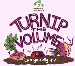
National Farm to School Month!