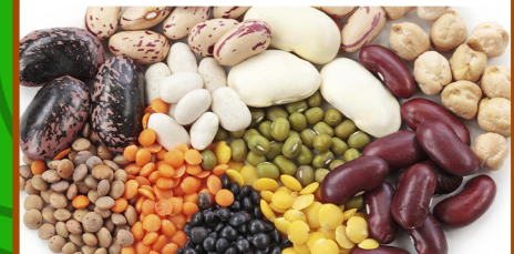
Legumes Beans, Peas, Lentils