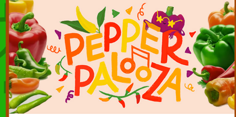
PEPPER PALOOZA OCTOBER FARM TO SCHOOL MONTH GEORGIA ORGANICS