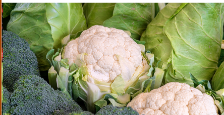
Cruciferous Vegetables Cabbage, Broccoli, Cauliflower