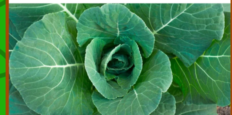
Greens Collard, Mustard, Turnip