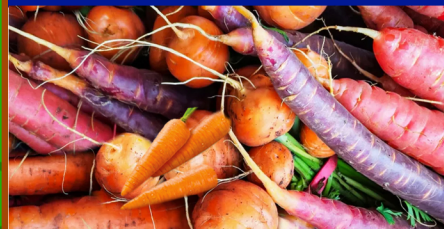
Root Vegetables Carrots, Beets, Radishes